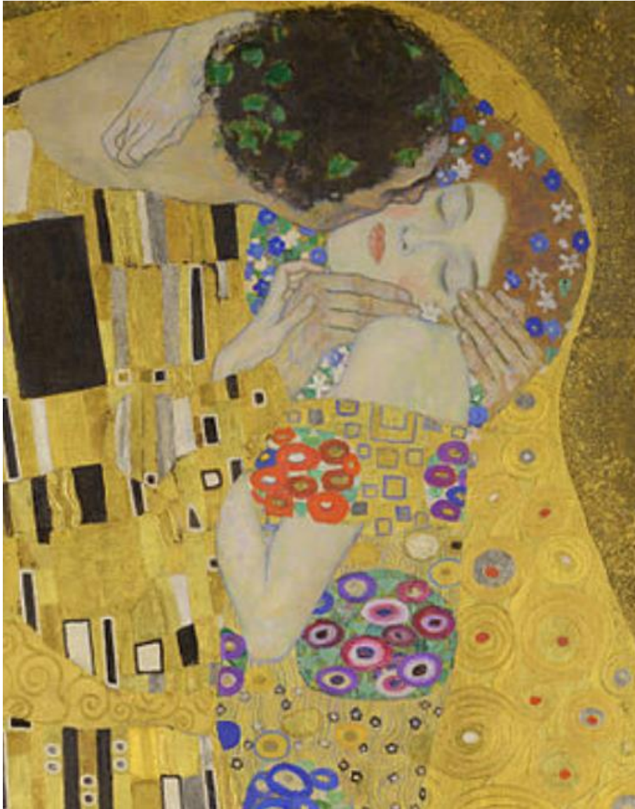
The Kiss by Gustav Klimt, 1908