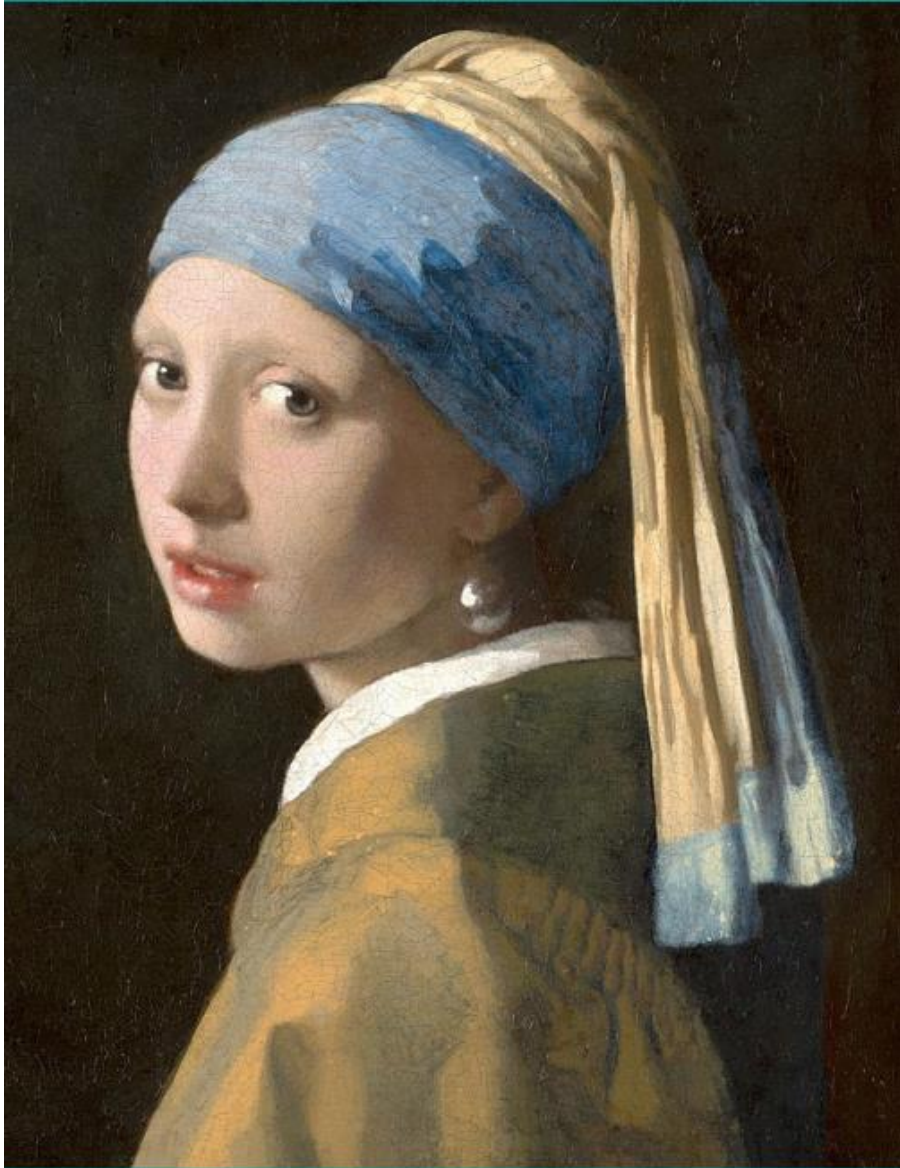
Girl with a Pearl Earring by Johannes Vermeer, 1665