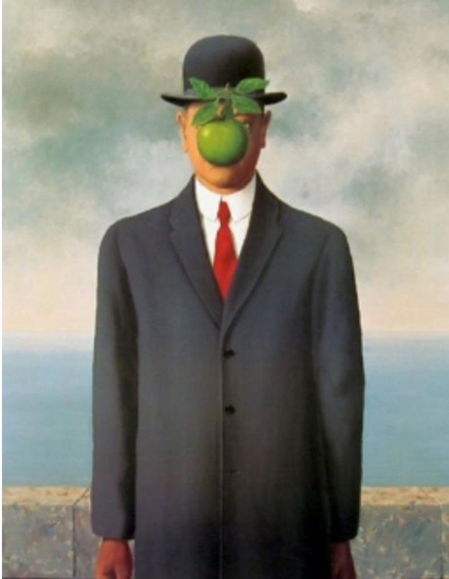
The Son of Man by René Magritte, 1964