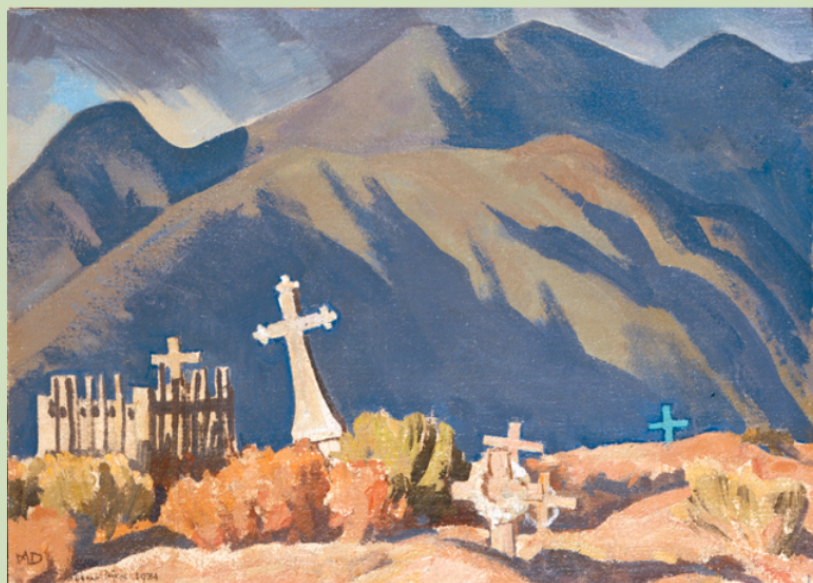
Maynard Dixon, Sketch for 'Campo Santo,' 1934

This painting depicts a Hispanic graveyard called a camposanto (holy field) set amid the barren desert, contrasted by the enormous and lushly green Sangre de Christos (the Blood of Christ) mountains as a backdrop.